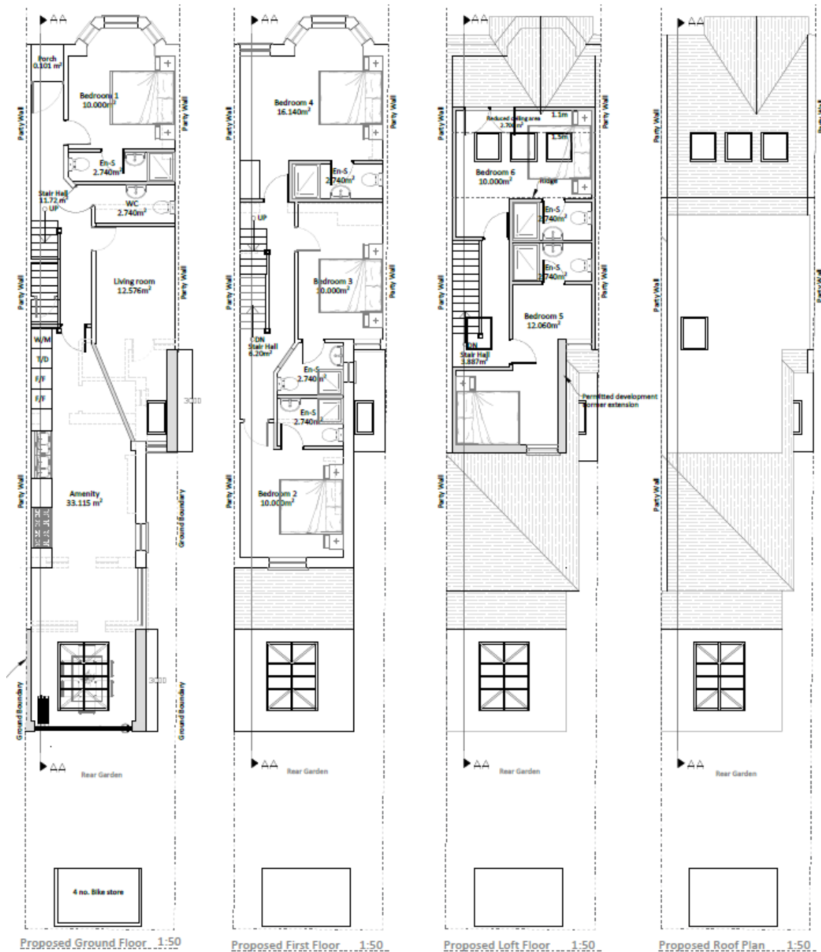
Figure 2 - Proposed plans

3.3 The Applicant intends to construct two small rear extensions, a dormer extension within the main roof and roof alterations as permitted development, as shown below in the drawing below, to facilitate the enlargement of the property before undertaking the proposed development. The extensions and alterations can be completed under permitted development regardless of whether the property is in Class C3 or C4 use.